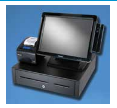
Two Cash Drawer Ports Supports Optional Cash Drawers