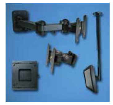
Standard VESA Configuration Fits a Variety of Wall and Ceiling Mount Brackets