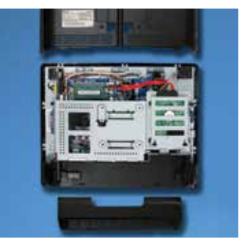
Tool-Free Access to RAM Optimizes Serviceability