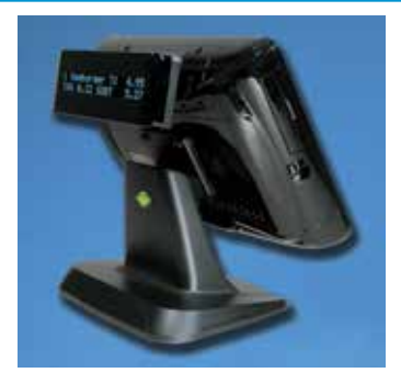
Optional Integrated VFD Customer Display