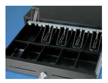
Standard cash drawer features a 5 bill, 5 or 6 coin insert, two media slots and a standard security lock and key.