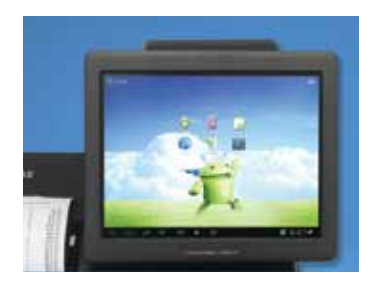
Use the adjustable 9.7" color touch screen for operating the POS solution by touch.

An extremely cost-effective and environmentally friendly bundle – each SAP-500 Series includes a large 9.7" touch screen, high quality integrated thermal printer, international-style cash drawer, choice of raised-key or flat spill-resistant keyboard, integrated card reader, rear customer display and a secure SD port