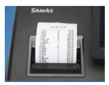
Reliable high-speed thermal receipt printer prints full-width 80mm paper and features quick and easy drop-in paper loading.