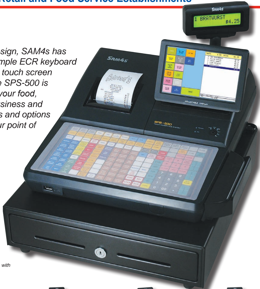
SPS-500 Series Hybrid ECRs Shown with Optional Card Reader

Featuring a hybrid design, SAM4s has combined fast and simple ECR keyboard entry with an intuitive touch screen operator display. The SPS-500 is easily configured for your food, beverage, or retail business and provides the functions and options you need to meet your point of service needs.